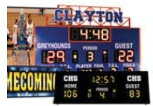
Scoreboard & Marquee Signage