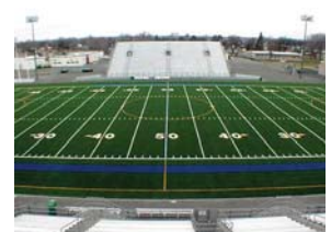
Track & Field