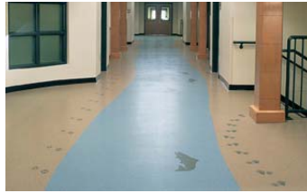
Carpet & Flooring