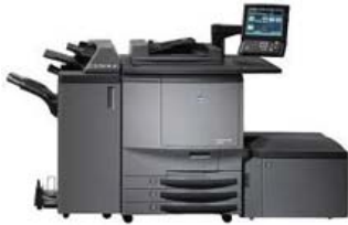
Copiers & Multifunction Devices