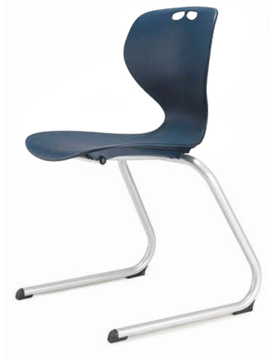
BFF Cantilever Chair, pictured with standard glide