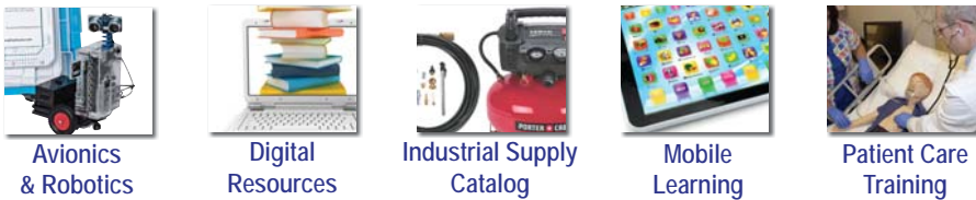
Avionics & Robotics