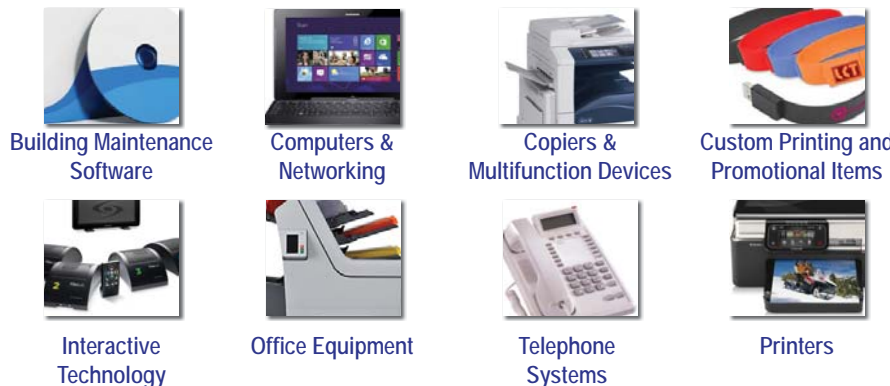
Building Maintenance Software