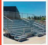
ANGLE FRAME BLEACHERS