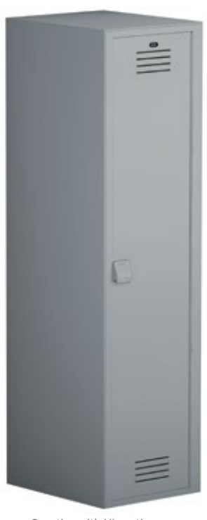
One tier with XL option shown with end panel