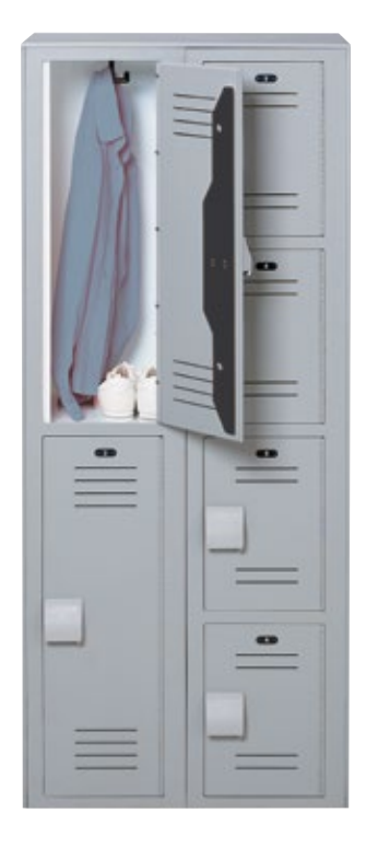
Two tier and four tier styles