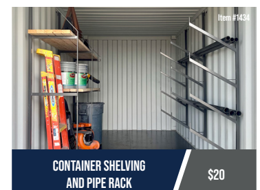
CONTAINER SHELVING AND PIPE RACK