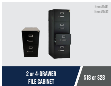
2 or 4-DRAWER FILE CABINET