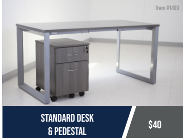
STANDARD DESK & PEDESTAL