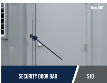
SECURITY DOOR BAR