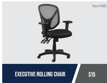
EXECUTIVE ROLLING CHAIR

Basic or padded steel folding chair with a triple-welded cross brace for stability.