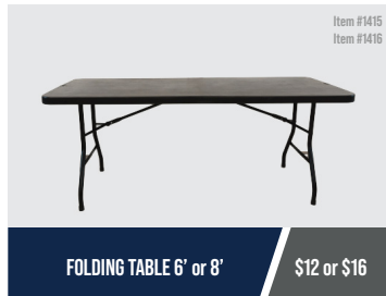
FOLDING TABLE 6' or 8'

Premium laminate tables start at 8' and come in 2' increments (10', 12', etc.). Tops include predrilled grommet holes; powered grommets available at extra cost.