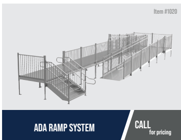
ADA RAMP SYSTEM