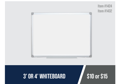
3' OR 4' WHITEBOARD

Our 6'x6'x67"H cubicles include a powered spine, pedestal storage, and overhead shelving. *Installation labor is not included and will be added to your lease quote.