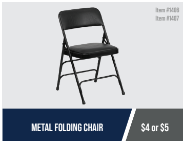
METAL FOLDING CHAIR

Dry-erase whiteboard with aluminum frame. Dimensions: 24" x 36" or 36" x 48".