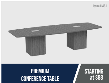
PREMIUM CONFERENCE TABLE

30" x 60" multi-purpose training table. Can be used in break areas and kitchens or combined with other training tables for conference rooms.