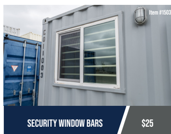
SECURITY WINDOW BARS

Security door bars on all exterior doors.