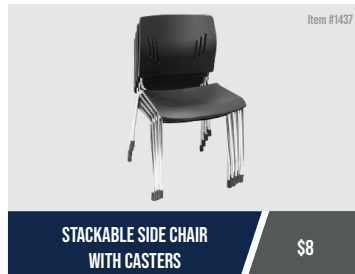
STACKABLE SIDE CHAIR WITH CASTERS

Fully adjustable ergonomic mid-back rolling executive chair for desks, workstations, and conference tables.