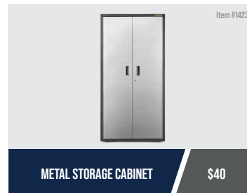
METAL STORAGE CABINET

Adjustable-shelf laminate bookcase 48"H.