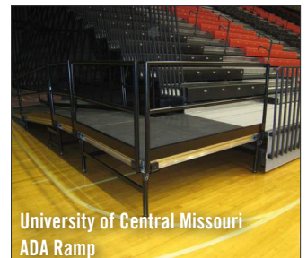
University of Central Missouri ADA Ramp