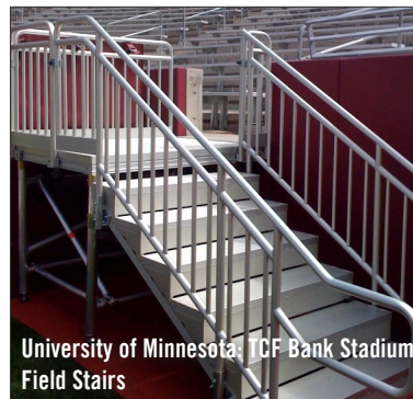
University of Minnesota: TCF Bank Stadium Field Stairs