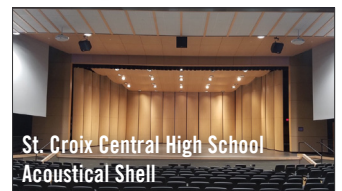
St. Croix Central High School Acoustical Shell