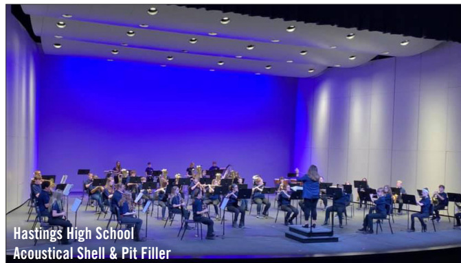
Hastings High School Acoustical Shell & Pit Filler