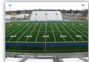
Track & Field