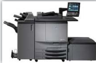
Copiers & Multifunction Devices