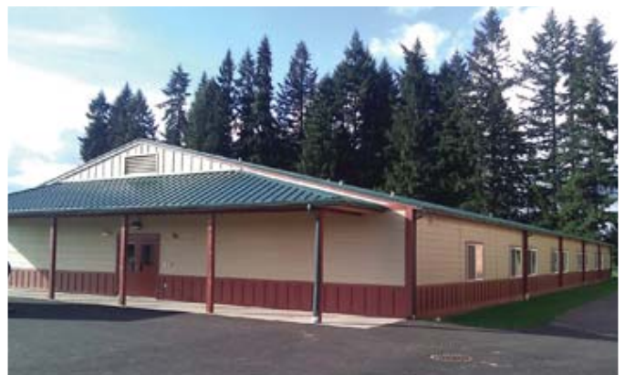
Mike Rebitzke KCDA's Field Rep took this picture of the completed building.