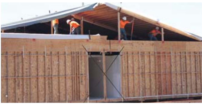
After each of the sections is placed, the roof is raised, as seen here.