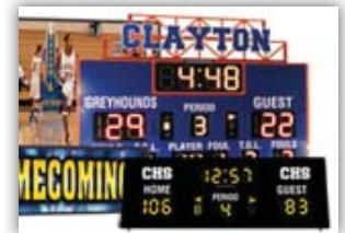
Scoreboard & Marquee Signage