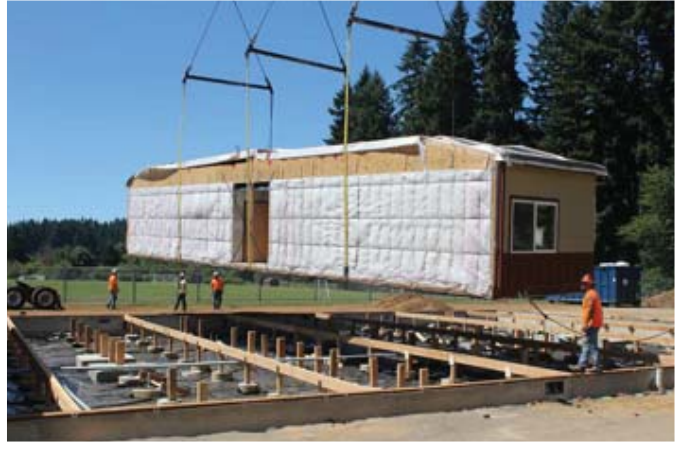
One of 11 sections that compose a new modular classroom building is swung into place on the Pleasant Valley campus Thursday, July 25.

All three new modular structures have 10 classrooms, restrooms and custodian's storage area. They were built by Blazer Industries of Aumsville, Ore., delivered by Bennett Trucking of Woodburn, Ore., lifted into place by Campbell Crane and Rigging Services of Portland and installed and prepared for occupancy by Acc-U-Set Construction of Washougal. Williams Scotsman of Portland was the general contractor.