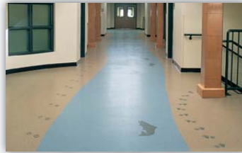
Carpet & Flooring