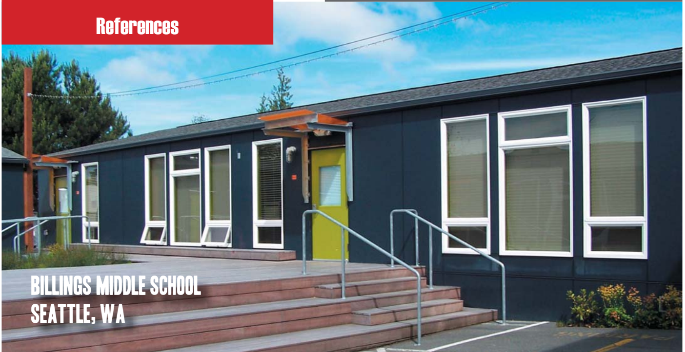
BILLINGS MIDDLE SCHOOL SEATTLE, WA